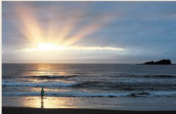
PERFECT START TO DAY: Sunrise at Mudjimba Beach.