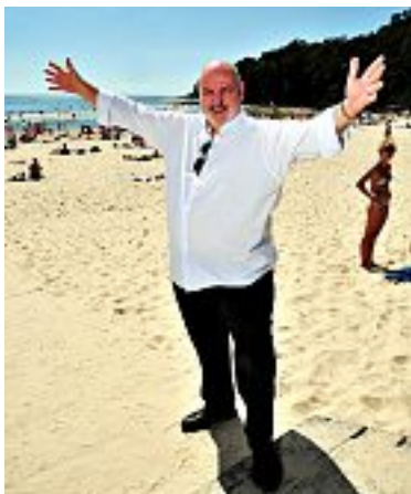
He says Australians have a great sense of humour, and it's fascinating to listen to conversations and the nicknames used.

He says he loves the honesty and non-pretentiousness of Coast people.