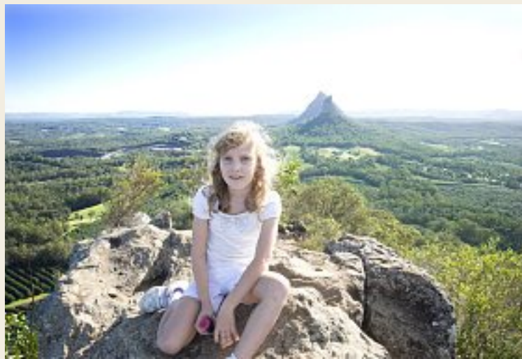
ENVIABLE OUTLOOK: A young Coast resident on top of Mt Ngungun.